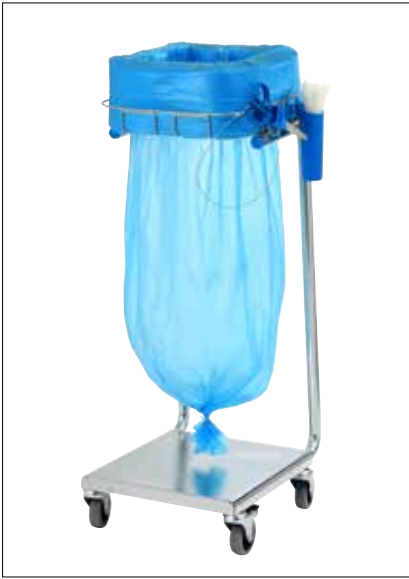
Stand Dynamic Mini/Mini Pedal