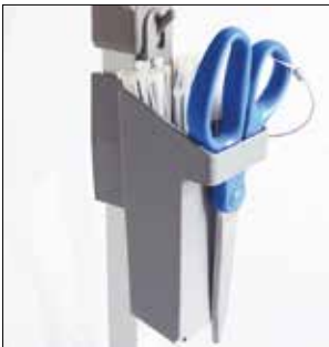
Cable-tie holder for Longopac Stand Classic Standard, grey. Item no. 30410 Metal-detectable, blue. Item no. 30416

The cable-tie holder speeds up bag changes even more and holds the cable ties in place. Suitable for both Maxi and Mini, and available in two versions.