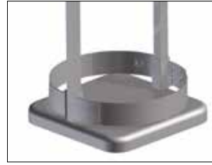
Frame for Longopac Stand Classic Maxi Item no. 33900 The frame holds the bag in place.