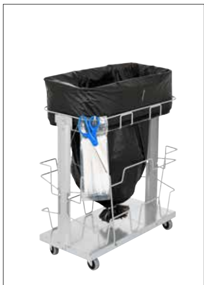
Stand Dynamic UBS