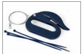
Safety kit Cutter blue kit Item no. 30440 Contains cutter, metal detectable PP. Wire in stainless steel and cable ties, metal detectable PA