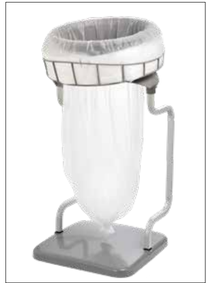
Stand Classic Recycling