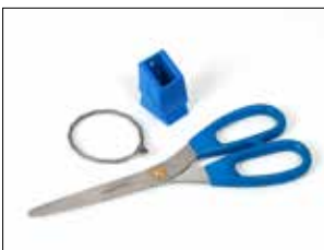
Scissors kit for Longopac Stand Dynamic, metal-detectable Item no. 34609 Kit containing metal-detectable scissors, scissors holder, stainless steel wire.