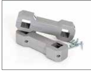
Connector for Longopac Stand Classic Item no. 33750 Connects two or more Longopac Stand products simply and securely. It is also possible to connect Maxi to Mini.