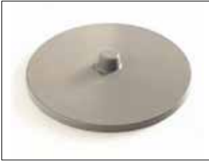
Lid for Longopac Stand Classic Maxi and Mini Mini Item no. 31140 Maxi. Item no. 30140