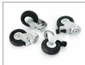
Stand Dynamic ESD Kit Wheels Item no. 34616 Contains four castor wheels, two of them with brakes. Replaces the original wheels on stands used in ESD restricted areas.