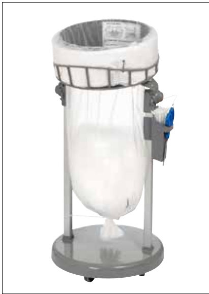
Stand Classic Mini/Mini Food