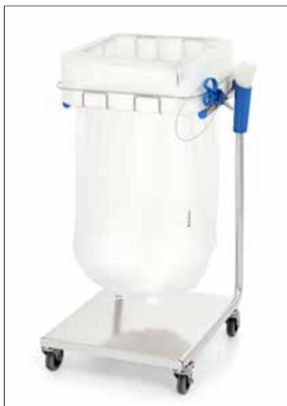
Stand Dynamic Midi/Midi Pedal