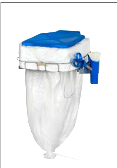
Mini Flex with lid

Wall-mounted solutions are ideal for areas with limited space and where hygiene is important. They also facilitate cleaning.