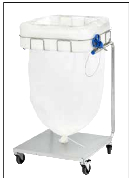
Stand Dynamic Maxi/Maxi Pedal