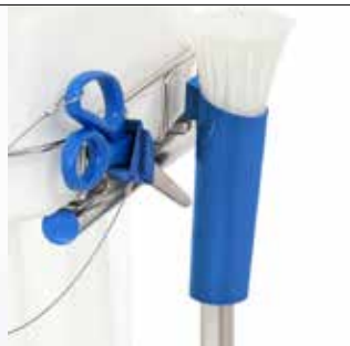
Cable-tie holder for Longopac Stand Dynamic Item no. 30410 (only holder) The cable-tie holder for the Dynamic range is suitable for Mini, Midi and Maxi Dynamic.

The cable-tie holder speeds up bag changes even more and holds the cable ties in place. Suitable for both Maxi and Mini, and available in two versions.