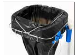
Rubber band Item no. 3102 This accessory can be used together with all Longopac cassette holders. Effectively locks the cassette in place and prevents it from unraveling.