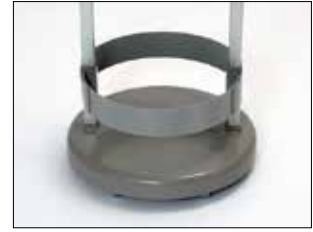
Frame for Longopac Stand Classic Mini Item no. 33890 The frame holds the bag in place.