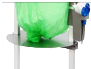
Adjustable plate for Stand Classic Mini Item no. 31480 Reduces the consumption of bag material and reduces the size of the bag. Primarily intended for use with sticky, heavy waste. Can be used for Bio bag cassettes.