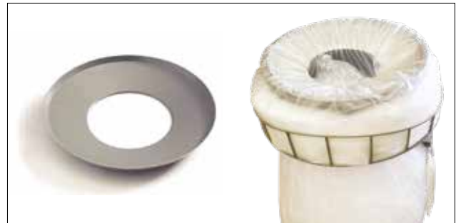
Adapter disc for Longopac Stand Classic Maxi Item no. 30170 Reduces the aperture for easier compression of e.g. recycled plastic. Only available for Maxi.